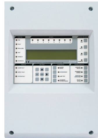
Single Loop Panel